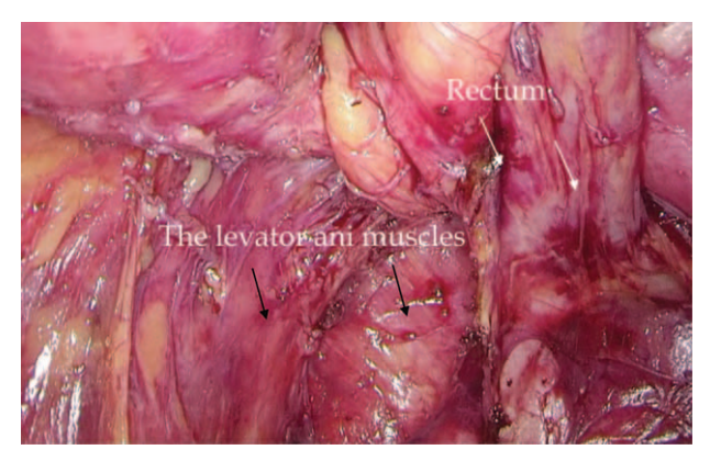
FIGURE 2. Dissection of the rectum. The rectum (white arrows) was dissected with the TME approach and proceeded circumferentially into the pelvic floor as distal as possible. The levator ani muscles were clearly displayed (black arrows).

The colon (10 cm proximal to the lesion) was transected laparoscopically using an endoscopic linear cutter (Ethicon<sup>®</sup>) ET60a, Johnson & Johnson, NJ). The proximal colon was extracted through a small incision of 3 to 4 cm extended from the bottom-right pore, which was also used as the site of loop