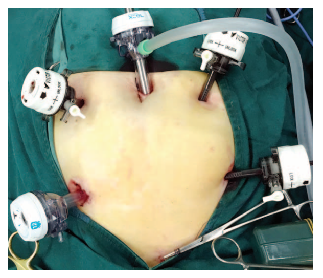
FIGURE 1. Five working ports were selected for the laparoscopic procedure. The bottom of the image presents the patient's caudal side. For a female patient, uterus hanging may be recommended. This can be fulfilled by placement of a 2–0 Prolene suture on the uterus. The stitch was then introduced outside the abdominal wall and fixed with adequate tension.

The patient was placed supine in the modified lithotomy position, and 5 ports were inserted (Figure 1). The Trendelenburg position was used following abdominopelvic exploration. At the iliac trigone, the medial mesenteric attachments were incised using an ultrasonic activated scalper (Harmonic<sup>®</sup>, Johnson & Johnson, NJ), and the superior hypogastric nerve plexus was identified and preserved. Proximal lymph node dissection was performed at the origin of the superior rectal artery. The superior rectal artery was dissected and transected following the application of Hem-o-Lock clips (Teleflex Inc., USA). The mesorectum was separated with the TME technique, which is similar to previously described reports.<sup>28,36</sup> The mesentery of the sigmoid colon was manipulated as little as possible. Toldt fusion fascia was moved posteriorly, and the gonadal vessels and ureters were preserved. The retrorectal