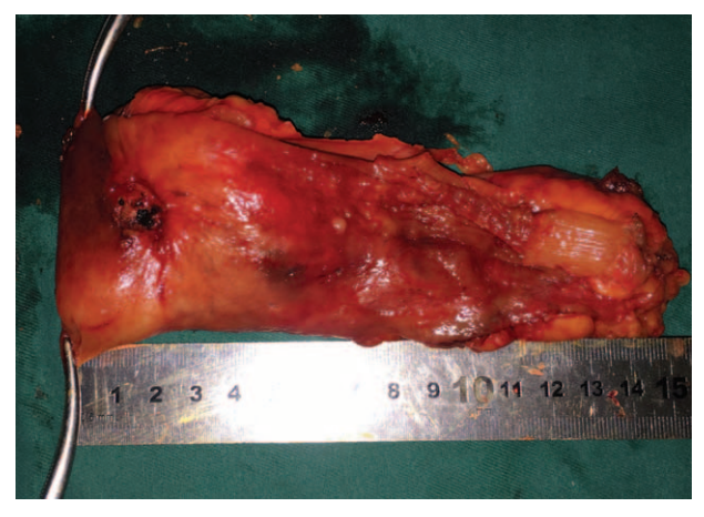
FIGURE 5. The specimen was removed and inspected. For this case, the distance from the lower edge of the lesion to the resection line was approximately 1 cm (ensuring an adequate distal margin). The margin was confirmed by pathologic examination.

We analyzed surgical safety, pathology outcomes, postoperative recovery, and early follow-up data for each patient