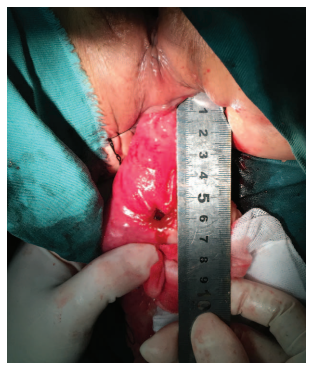
FIGURE 3. The distal rectum was everted and pulled outside the anus. The inner mucosa and the lesion were everted. The distance from the lower edge of the lesion to the dentate line was determined under direct vision.

ileostomy (LI) formation. An extra 5 to 10 cm of proximal colon was resected under direct vision to ensure a safe proximal margin. An anvil from a 29- or 33-mm circular stapler (CSC-29 or CSC33, KOL<sup>®</sup>, Touchstone International, Suzhou, China) was secured to the colon with a purse string suture. Then, the proximal colon was returned, followed by closure of the abdominal wall and re-establishment of the pneumoperitoneum.