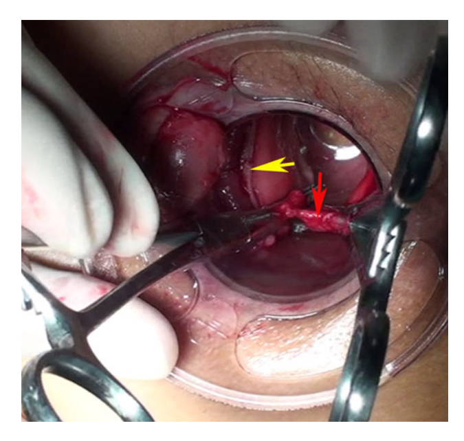
Fig. 1 A minimal mucosal bridge ( red arrow ) with some staples connecting the two edges of the mucosectomies was found and dissected using electrocautery. The yellow arrow indicates the staple line